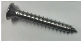
LAG SCREW QTY. 2