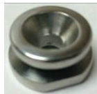
BUTTON QTY. 2